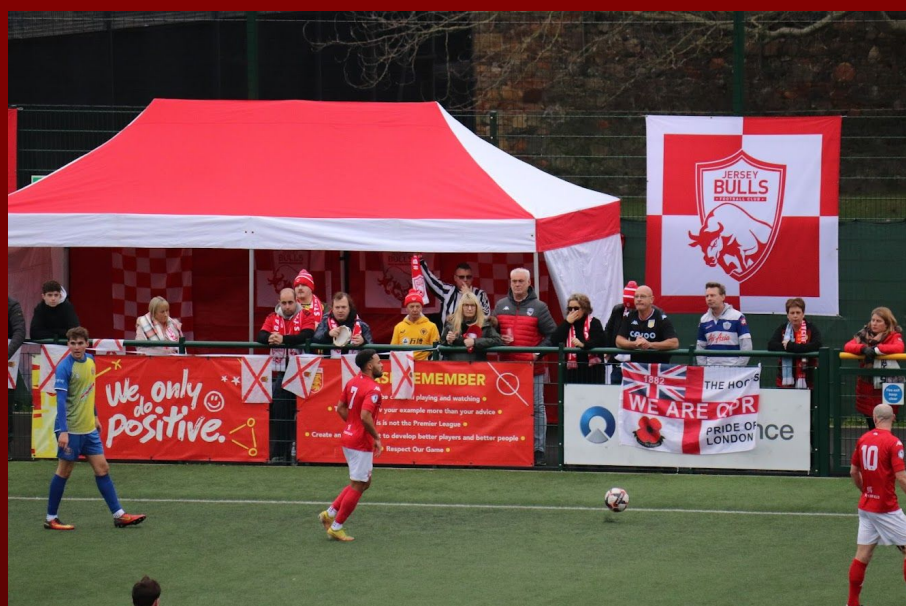
Jerseys ‘Bull’ Pen from our visit last season

The Springfield Stadium 2 Janvrin Rd, St Helier, Jersey JE2 4LF