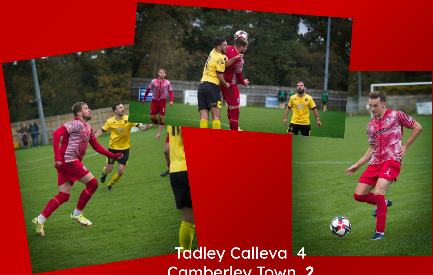
Tadley Calleva 4 Camberley Town 2 28th October 2023